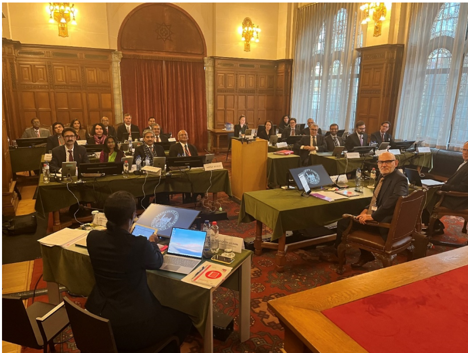
The First Meeting of the Neutral Expert with the Parties, February 2023