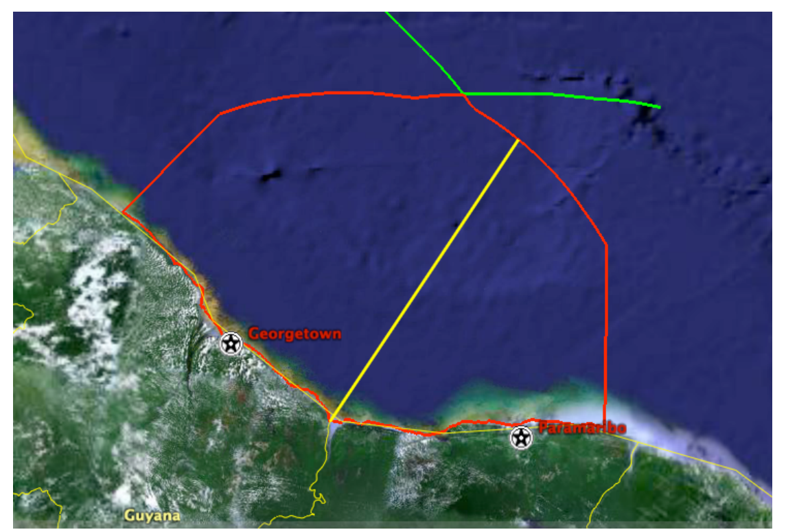
Figure 14. Division of the region shown in Figure 9 by the 34-degree line. The yellow line is a loxodrome with a bearing of 34 degrees. The green curves are extensions of the 200 nmi boundary.