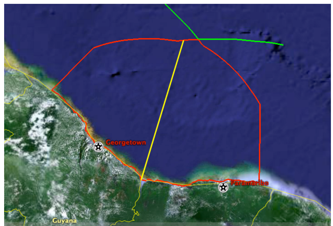
Figure 11. Division of the region shown in Figure 9 by the 17-degree line. The yellow line is a loxodrome with a bearing of 17 degrees. The green curves are extensions of the 200 nmi boundary.