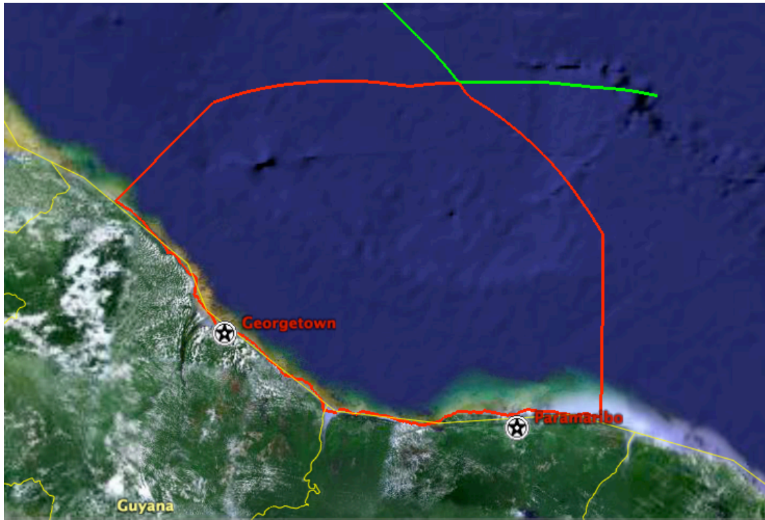
Figure 9. Region defined by the low-tide coast, the projections of the area lines and, the 200 nmi boundaries. The red curve outlines the entire region. The green curves are extensions of the 200 nmi boundary.