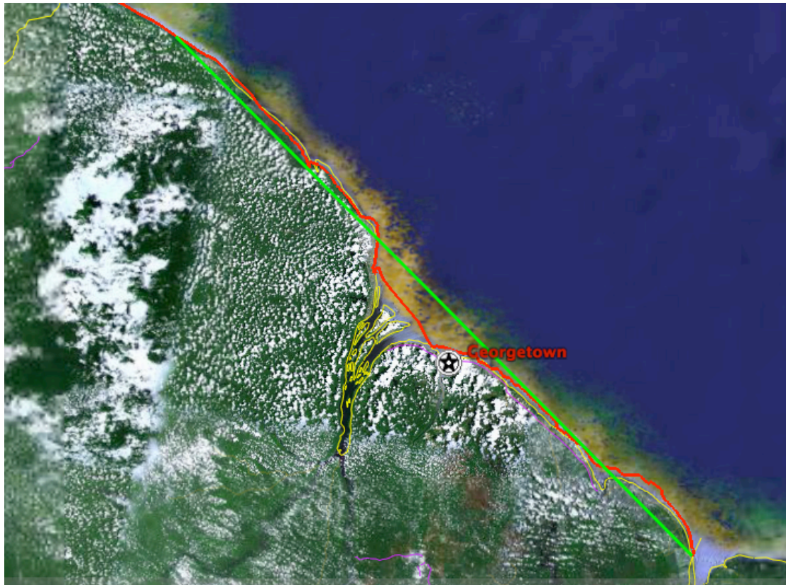
Figure 1. Area-balance line for Guyana. The red curve is define by the low-tide points for Guyana that are given in Table 1. The green line is the area-balance line.